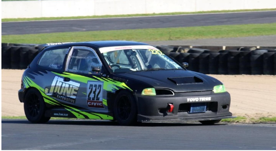
Josh Penny IPC Champion 2018 and 2019

With only 6 weeks to go until race season 2019 gets under way, it's time to whip off those dusty car covers and start slinging some spanners around. But before you head off to do that, take note that Round 1 has been pushed back a week, and will now be on Sunday 29th September.