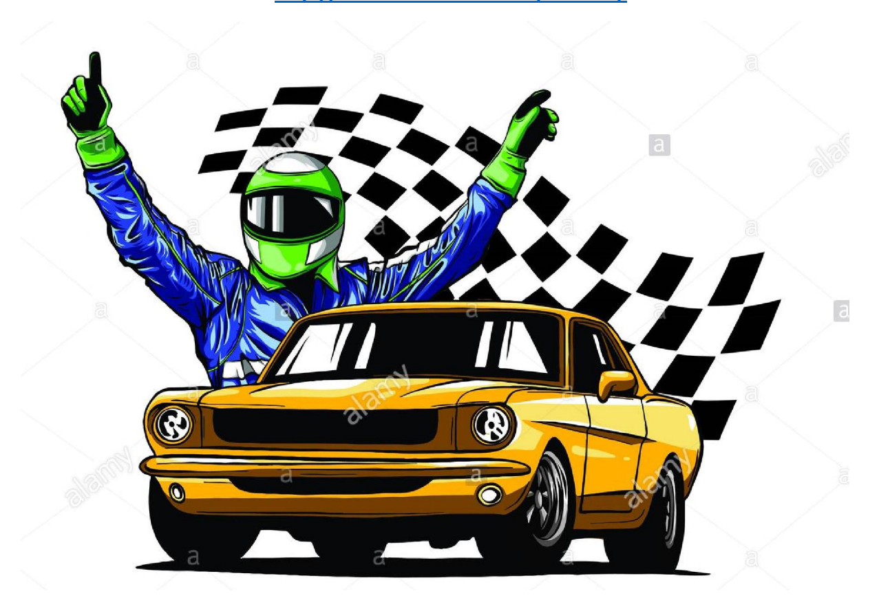
Prepare to "Start Your Engines"

Download a PDF Version at <a href="http://www.hrcevents.co.nz/content/">http://www.hrcevents.co.nz/content/</a>