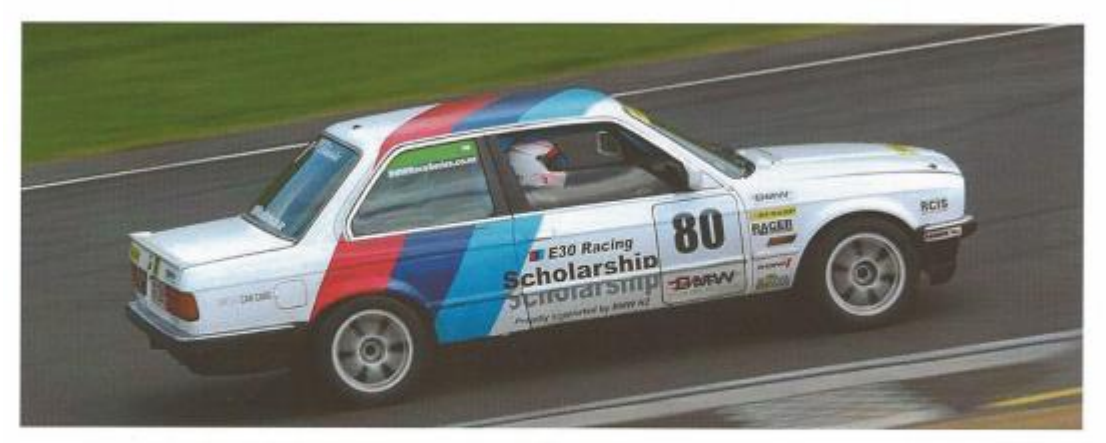
Want a funded Scholarship season in a record setting BMW racecar? Are you good enough? Check out the details, FAQ and Application Form at - bmwraceseries.co.nz/scholarship-car and register for the BMW Scholarship Event, Saturday 15 August. Be quick entries closing soon.