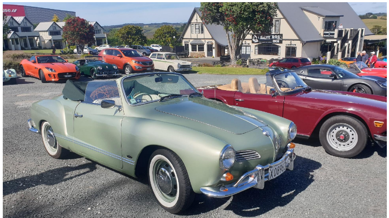
TR REGISTER, HRC, TACCOC, Club Lotus ANNUAL POPULAR XMAS BREAKFAST RUN: