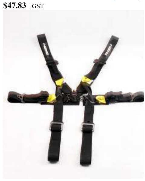
RACING HARNESS NZKW SFI Arm Restraints for Speedway racing