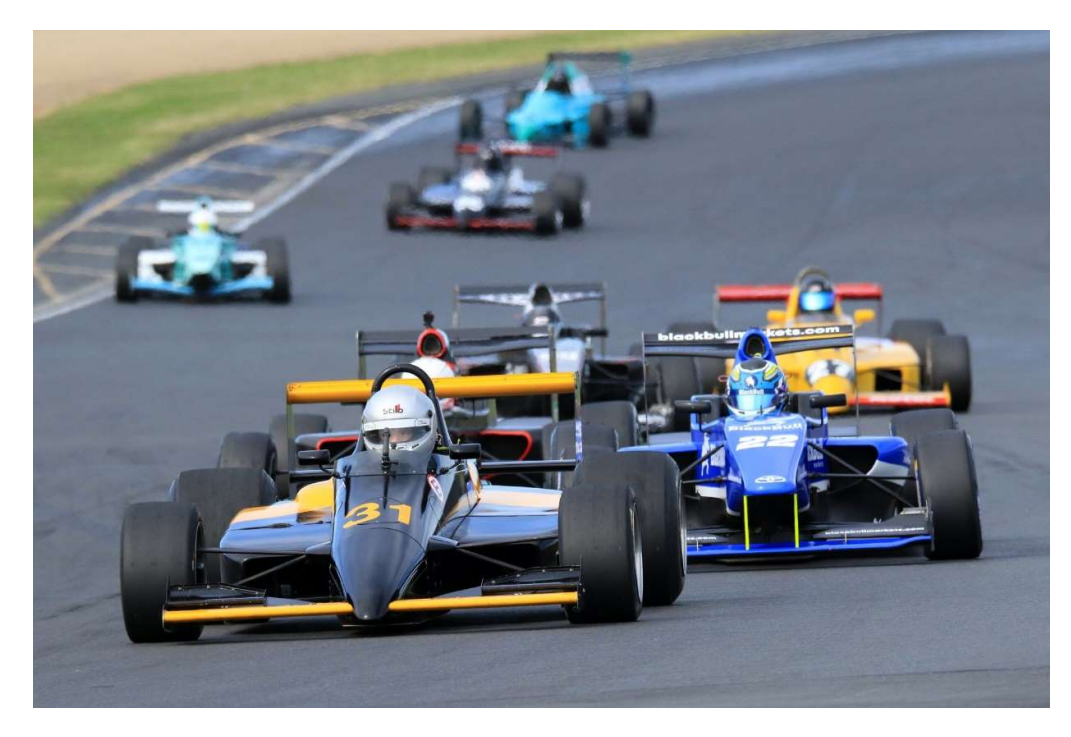
Formula Open - The Fastest growing single seater class in NZ

Facebook HRCEventsNZ Facebook New Zealand Racing Drivers League