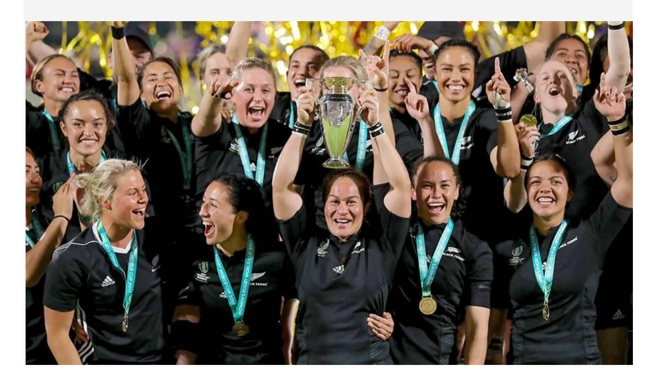
New Zealand's Fiao'o Faamausili lifts the trophy after the 2017 Women's World Cup Final.

Has the near billions spent on America's Cups over the years resulted in a tourism explosion here? If nothing else, it's certainly left Auckland with a waterfront infrastructure that probably wouldn't be there at all without the AC triumphs.