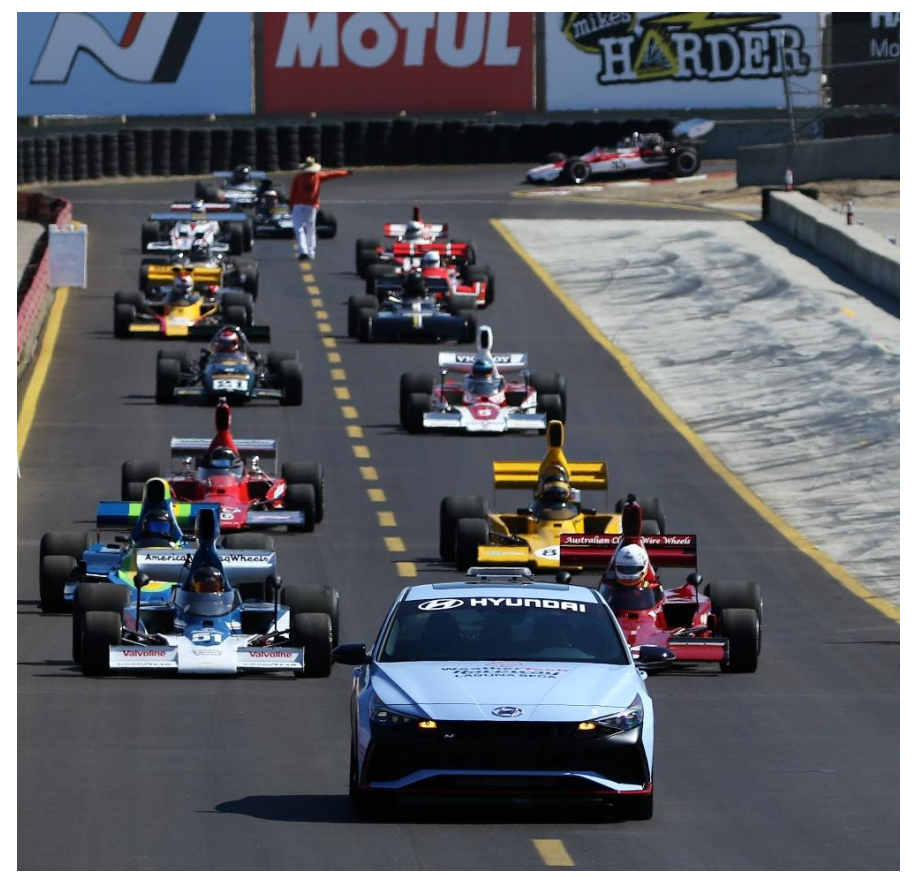
The 19-car F5000 field which contested this year's Rolex Monterey Motorsports Reunion meeting following the Pace Car around WeatherTech Raceway Laguna Seca.

VALUE OF COMPETING IN NZ/AUST F5000 TASMAN CUP REVIVAL SERIES DRIVEN HOME IN RESULTS AT ROLEX MOTORSPORT REUNION MEETINGS IN THE US THIS YEAR