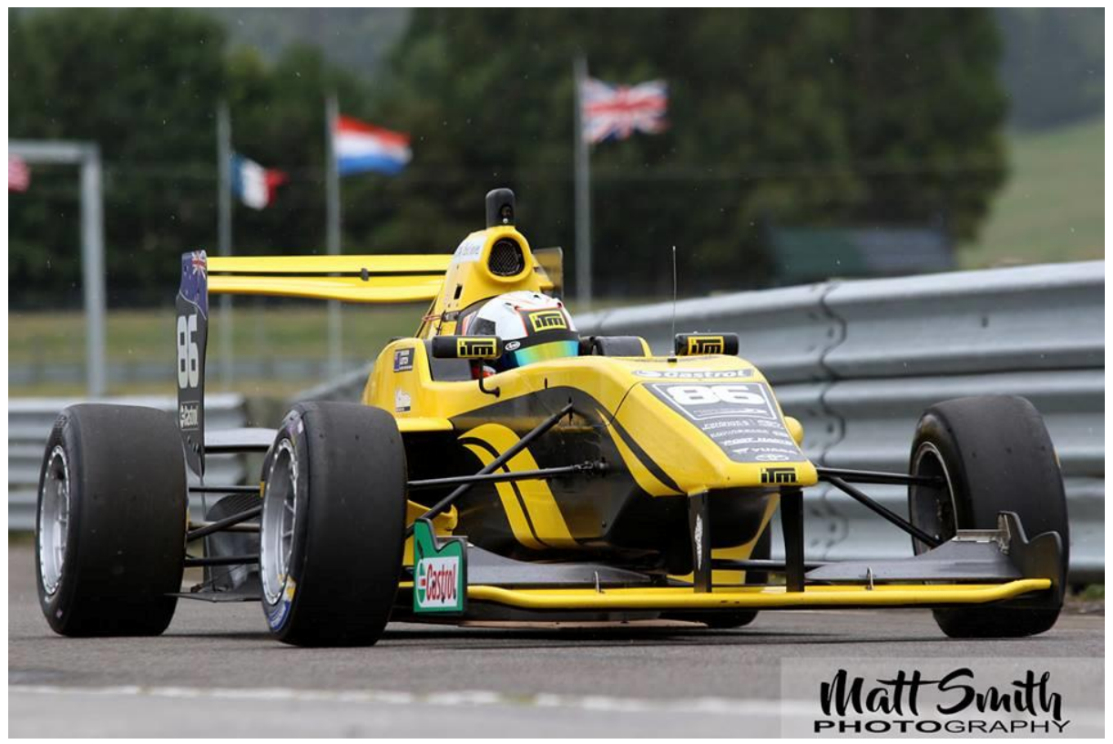
The following weekend 2<sup>nd</sup> 3<sup>rd</sup> February at Taupo is the next round of the NZ Premier Series and again HRC is working with Speedworks to promote a combined Speedworks / HRC meeting.

International Racing Action Means Big Weekend of Motorsport In Taupo.