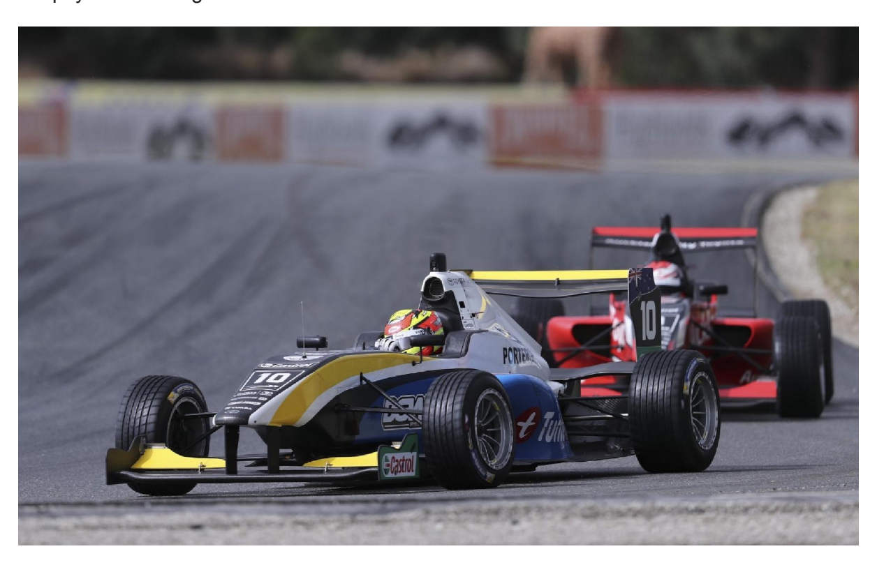
The Pass – by Liam Lawson

When entering on <a href="www.motorsportentry.com">www.motorsportentry.com</a> and paying by credit card. After doing the credit card transaction always wait for your entry to return to the <a href="www.motorsportentry.com">www.motorsportentry.com</a> page so the entry site can record the payment. If you log out on the bank page HRC is unaware of the payment leading to embarrassment at documentation.