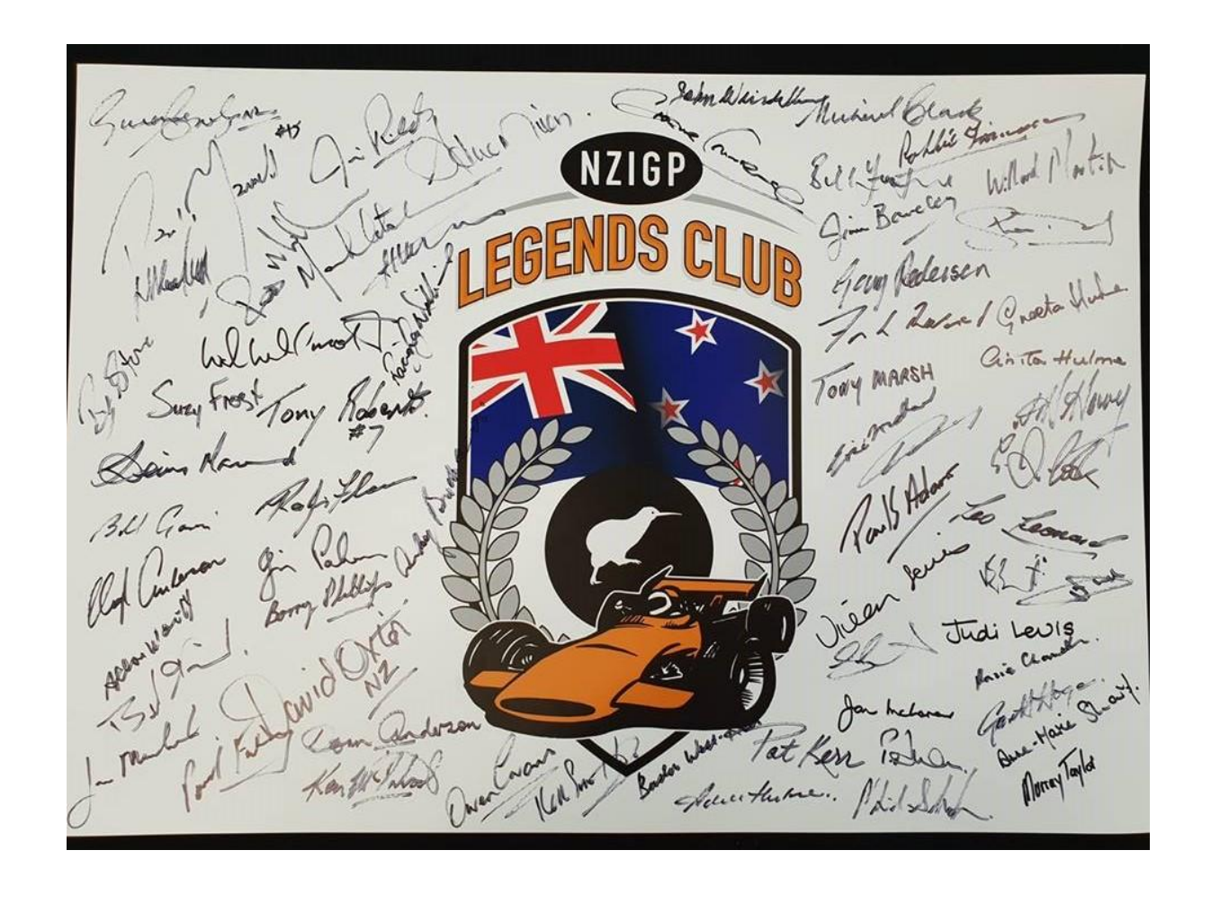
NZIGP Legends Club